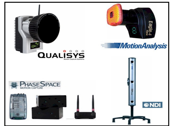
The MotionMonitor supports real-time collection from all of the popular passive and active optical tracking

The MotionMonitor is a totally integrated 3D data collection system for use in clinical, biomechanical, neuro-control, and sports medicine applications involving the analysis of complex motion. Data from Ascension magnetic trackers, NDI Optotrak optical sensors, Polhemus Fastrak / Liberty, SR Research's EyeLink ® II, Motion Analysis Corp & Qualisys passive video sensors, EMG, forceplates, video, and other analogue devices are collected by The MotionMonitor, fully synchronized, and presented in real time with state-of-the-art computer renderings and graphic displays. Data output includes all kinematic and kinetic data including joint forces and moments computed with either a top-down or bottom-up inverse dynamics model. Angle data is available as quaternions, cosine matrices, Euler angles, Grood & Suntay angles or projection angles. The user can specify the reference frame, rotation sequence, and axes layout in post-processing. User-defined data can be generated using standard math notation. Data can be reported in either the time or frequency domains and includes filtering functionality. Full body biomechanical computer renderings include stick figures, skeletons, and humanoids. Detail renderings include high resolution images of hand, foot, and spine as well as user-generated mesh files.