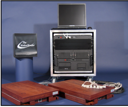
The MotionMonitor base unit shown here with Ascension magnetic trackers, Extended Range Transmitter and Bertec non-conductive forceplates.